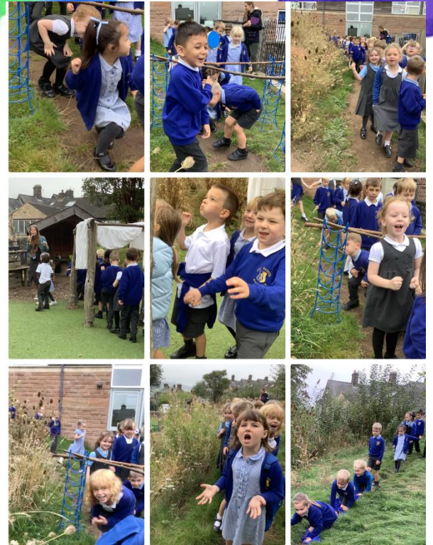
Year 1 have been on a Bear Hunt